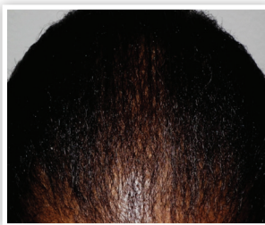
AFTER 8 WEEKS