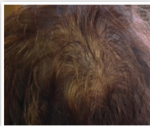
AFTER 8 WEEKS

Photos have not been altered in any way. Results may vary.