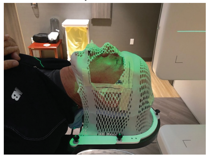
Figure 2. April 20, 2020

Figure 1. Patient undergoing IMRT for basosquamous cell carcinoma with extensive perineural invasion.